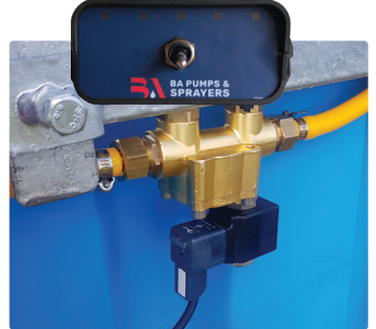
SMART-FIT ELECTRIC ON/OFF KIT