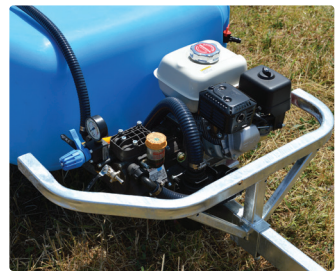
SMART-FIT PROTECTION BAR