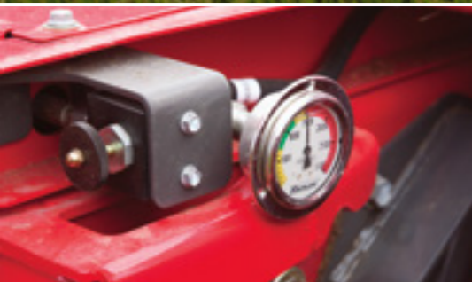
Hydraulic conditioning roll tension on the 1393 & 1316S. This is the first pull-type design to have this system.