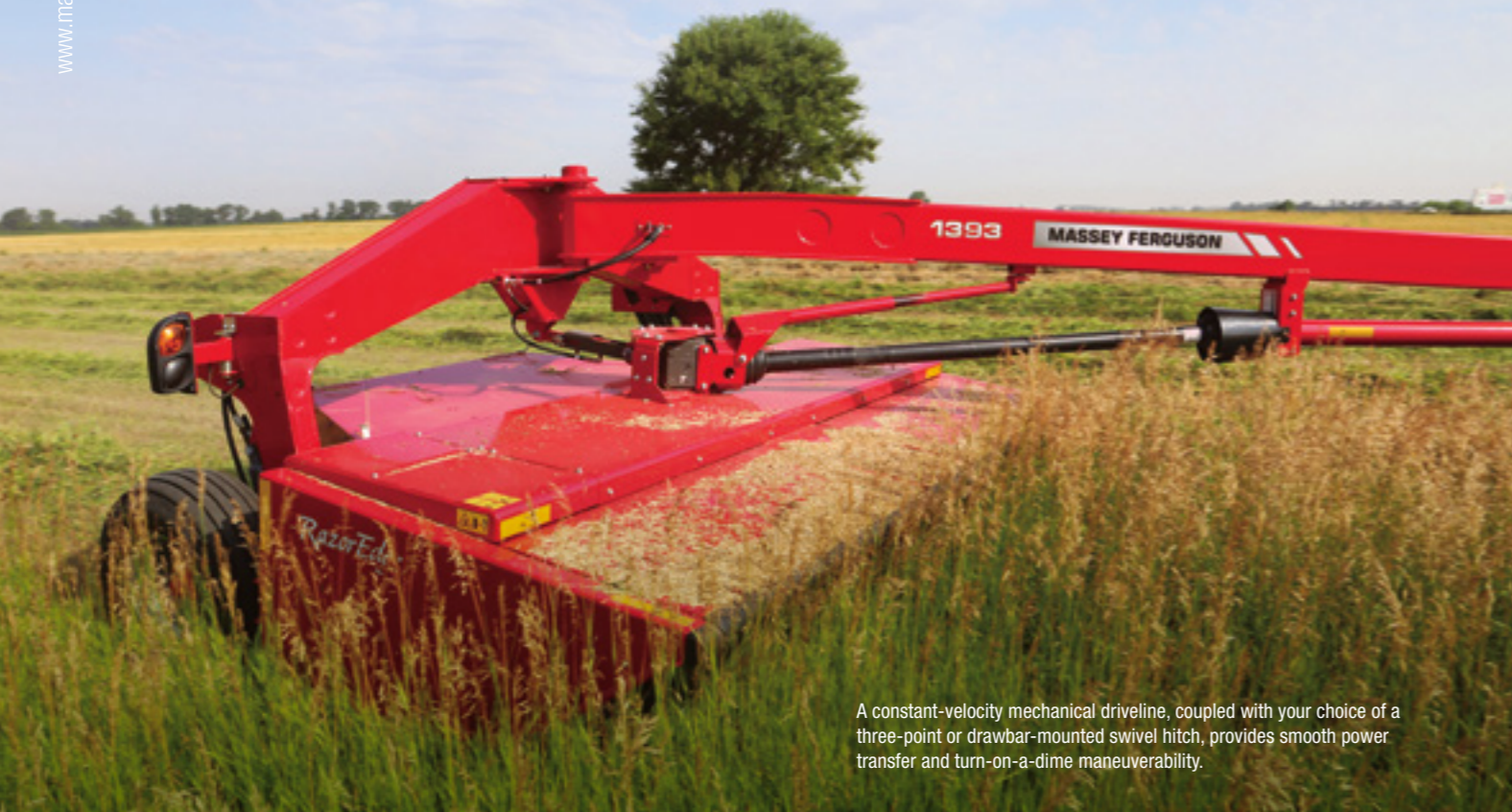
A constant-velocity mechanical driveline, coupled with your choice of a three-point or drawbar-mounted swivel hitch, provides smooth power transfer and turn-on-a-dime maneuverability.